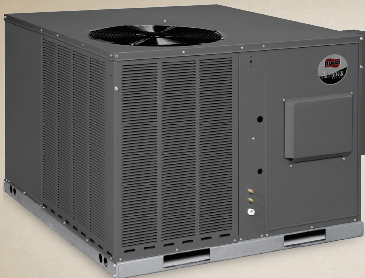
Achiever® Series Gas Electric Units RGEA14 / RGEA15 / RGEA16

We took it a step further and delivered PlusOne® advantages—unique Ruud innovations designed to make your job easier while providing homeowners with the ultimate home comfort experience.