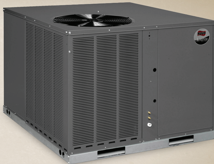
Achiever® Series Air Conditioners RACA14 / RACA15